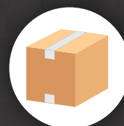
TOP & BOTTOM SEAL