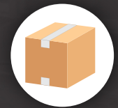
TOP & BOTTOM SEAL