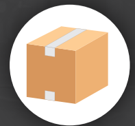
TOP & BOTTOM SEAL