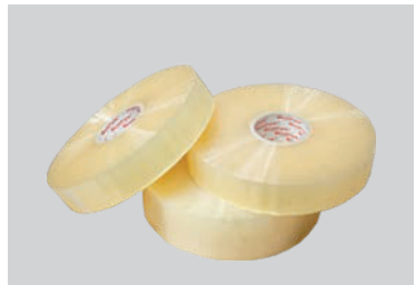
CARTON SEALING TAPE Put high quality tape on your BestPack Carton Sealer. Make sure to order machine length rolls for your new carton sealer.