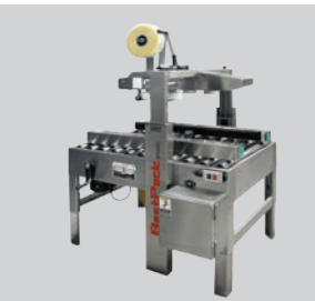
FOOD GRADE 304 STAINLESS STEEL This machine is available in 304 stainless steel which is food grade safe for food applications.