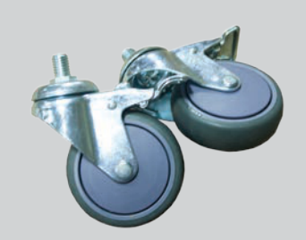
LOCKING CASTERS The heavy duty locking casters allow the carton sealer quick and easy mobility to other locations.