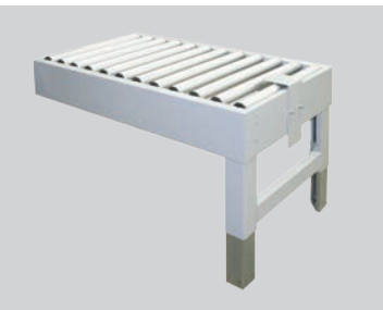
SHORT OR LONG INFEED/EXIT CONVEYORW/ L-BRACKET STABILIZER This 19.75" short or 39.5" long conveyor is a great work platform and allows for staging of cartons on the