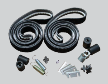
SPARE PARTS KIT *Spare Parts Kits may vary based on machine* Minimize downtime with BestPack's Spare Parts Kit.

This 19.75" short conveyor is a great work platform and allows for staging of cartons on the infeed and the exit.