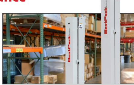
Wrap Height Extension Wrap tall loads with an extended wrap height column (16" increments) to accommodate your needs.