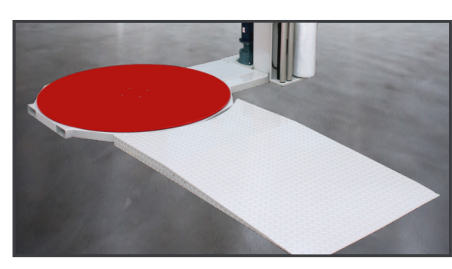
Loading Ramp Load your machine with a pallet jack using the made-to-fit loading ramp.

Weigh your loads directly on the S220 turntable. Verify shipping charges and protect against inventory shrinkage.